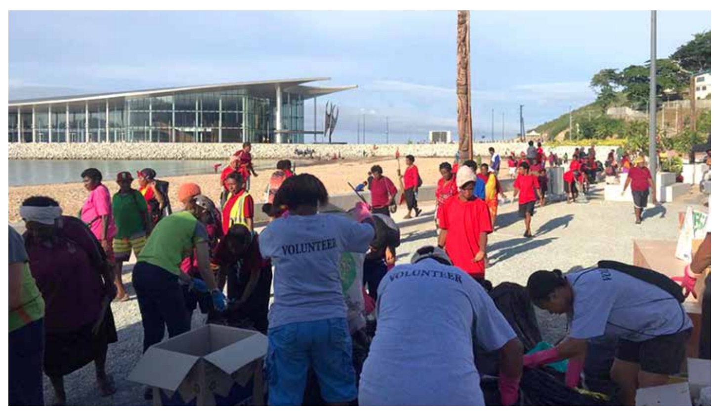
Trash to Treasure PNG event saw volunteers hard at work at Era Kone, just in front of the APEC Haus.

All the trash collected will be taken to Nature Park and sorted out for the park's trash to treasure project.