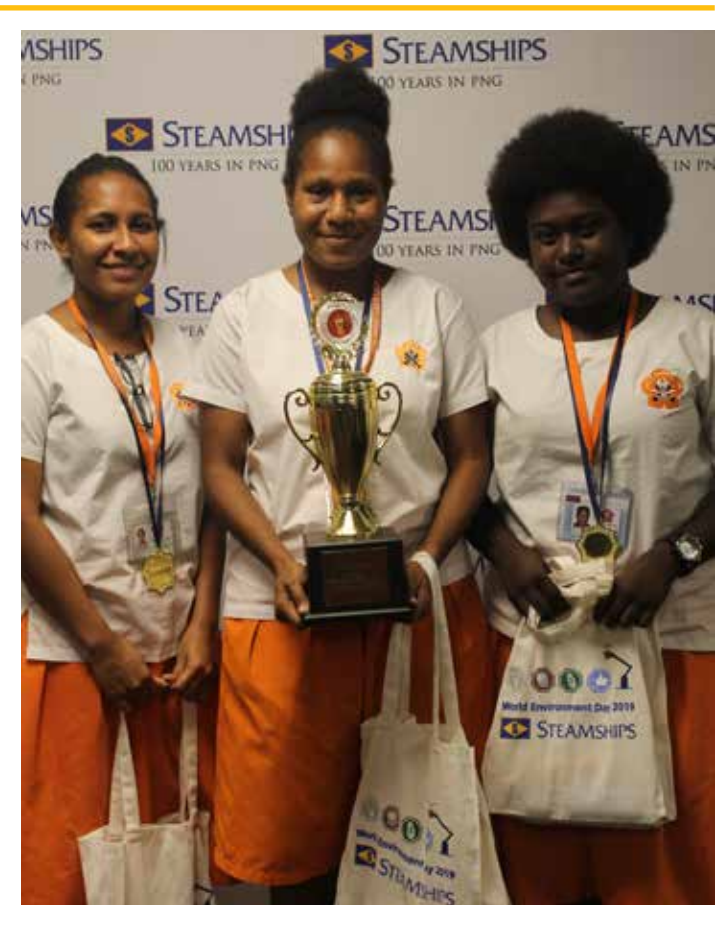
Top left: 2019 winners of the annual Steamships World Environment Day Schools Debate St. Charles Lwanga Secondary School Top right: 2nd place winners – Marianville Secondary School Below: 3rd place winners – PNG Paradise High School

This event was hosted successfully in partnership with Gateway Hotel, the Conservation and Environment Protection Authority, the Office of Climate Change and Development Authority and the National Capital District Commission.