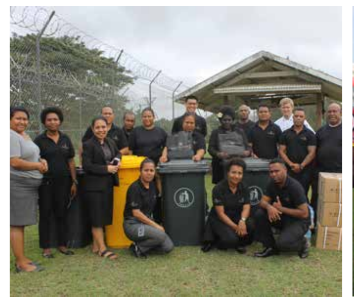
Grand Papua Hotel Management and Staff visit the Correctional Institution of PNG - Female Division as part of their monthly community engagement activities. During their visit the team donated toiletries, recycling bins and reading material to the institute.