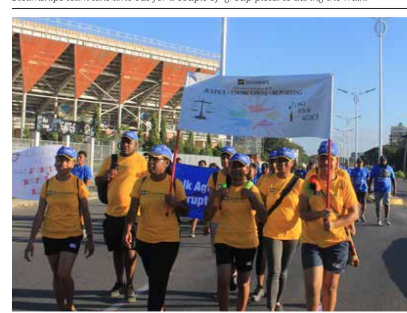
Steamships team take time out for a couple of group pictures during the walk.

The theme is aligned with Steamships Whistle Blower Policy to ensure that we adhere to the highest standards of business ethics, that all our businesses are conducted with integrity and promotes fairness and respect among all employees.