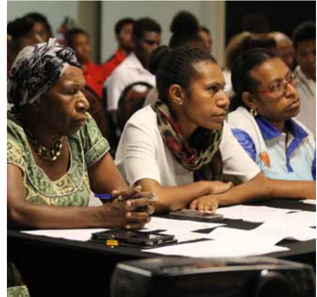
Judges at the STC World Environment Day Schools Debate in June. The judging panel included officers from CEPA, NCD and OCCDA.