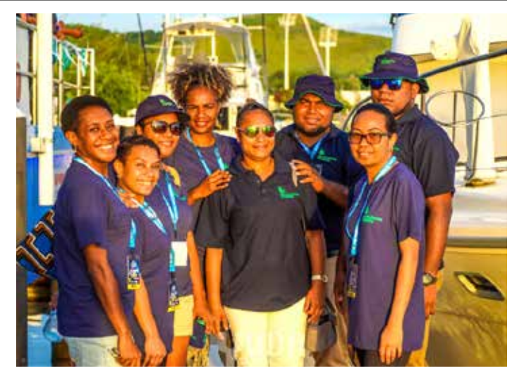
Staff of the Huon Gulf Hotel & Apartments in Lae, Morobe Province recently PPP Team down at the pontoon during the 44th National Games Fishing Championship.