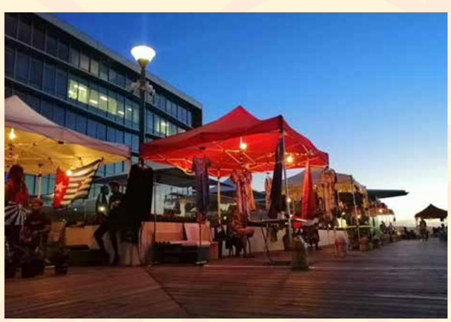
PPP in partnership with POM City Markets hosted its first ever, Harbourside Night Markets at the Harbourside Boardwalk on the 24th of April, 2019.

PacificPalms Property (PPP) hosted the inaugural Harbourside night markets in partnership with POM City Markets at Harbourside on the 24th of April, 2019. The night market saw a good number of families coming out at night to enjoy the market. There were Arts and Craft on