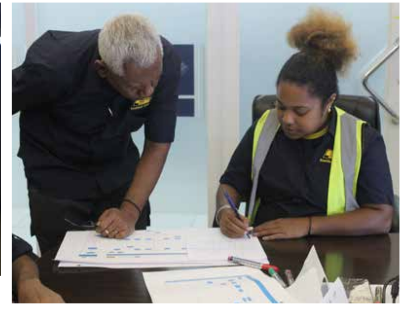
EWT Staff at the recent Customer Service training in Port Moresby.