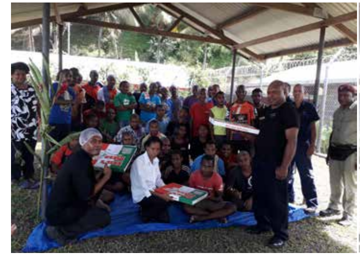
visited young boys at Buimo's Juvenile Detention Centre.