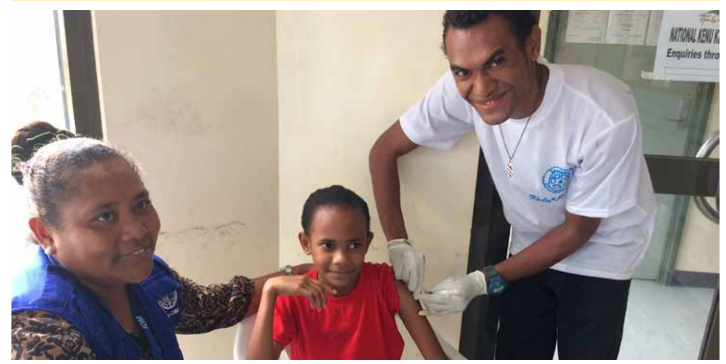
Above: A young girl in Milne Bay receiving her vaccination. Below: Kula Spirit continues its work in Milne Bay by visiting schools.