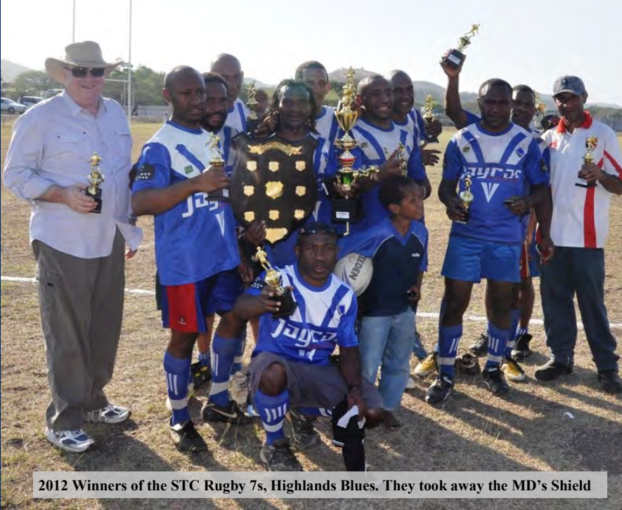
2012 Winners of the STC Rugby 7s, Highlands Blues. They took away the MD's Shield