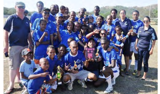
2012 Winners of Manager's shield, Hotel Pirates

The Steamships Rugby 7s for 2012 kicked off at the Bava Park on a high note with teams playing two fields unlike last year where it was held at PRL and played on one field.