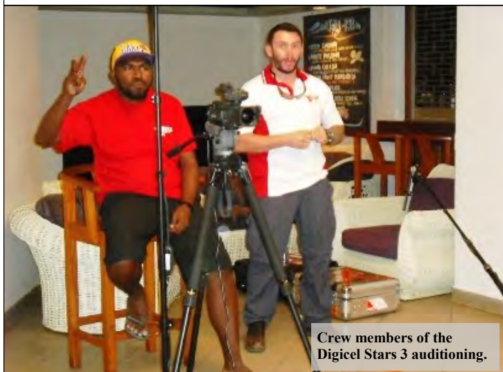
Crew members of the Digicel Stars 3 auditioning.