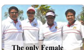
The only Female team