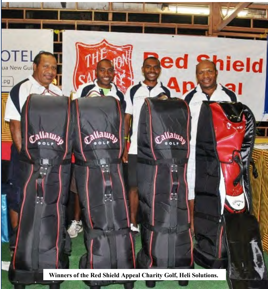
Winners of the Red Shield Appeal Charity Golf, Heli Solutions.

The Salvation Army Red Shield Appeal Charity Golf was a success with 36 teams participating in the tournament and about K120,000 raised from the tournament.