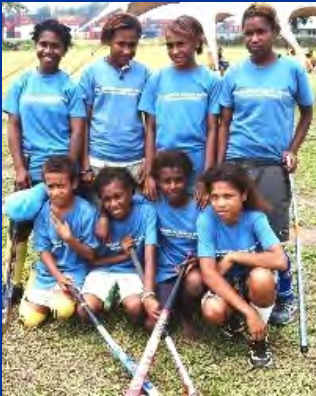
BELOW: Winners of the Under 18 Boys Hockey Championship sponsored by Consort Express Lines (CEL). BELOW LEFT: The Under 18 girls Hockey Team and RIGHT: The boys under 12 Hockey team.

The championship saw Consort's under 18 boys team take out the championship title.