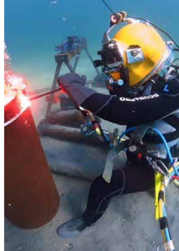
Above: Commercial divers provide underwater maintenance support to offshore gas rigs and are critical to a raft of diverse projects ranging from wreck retrievals to underwater surveys. Left: Pacific Towing's gender equality initiatives, including its 'Women in Maritime Scholarship' program, is in accord with the oil and gas industry's considerable push for the advancement of women.

Pacific Towing is increasingly becoming not only PNG's 'go to' provider for a range of marine services but also Oceania's and South East Asia's. The 40+ year old PNG operation, a subsidiary of the Steamships Group, also has businesses in Fiji and Solomon Islands. Moreover, it services several other countries including Australia, Indonesia, Micronesia, Philippines and Singapore.