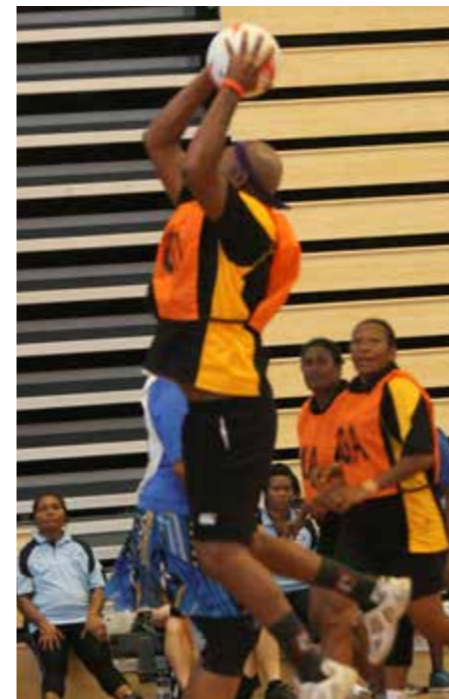
Truckies Lae, GD in mid-air taking a shot.