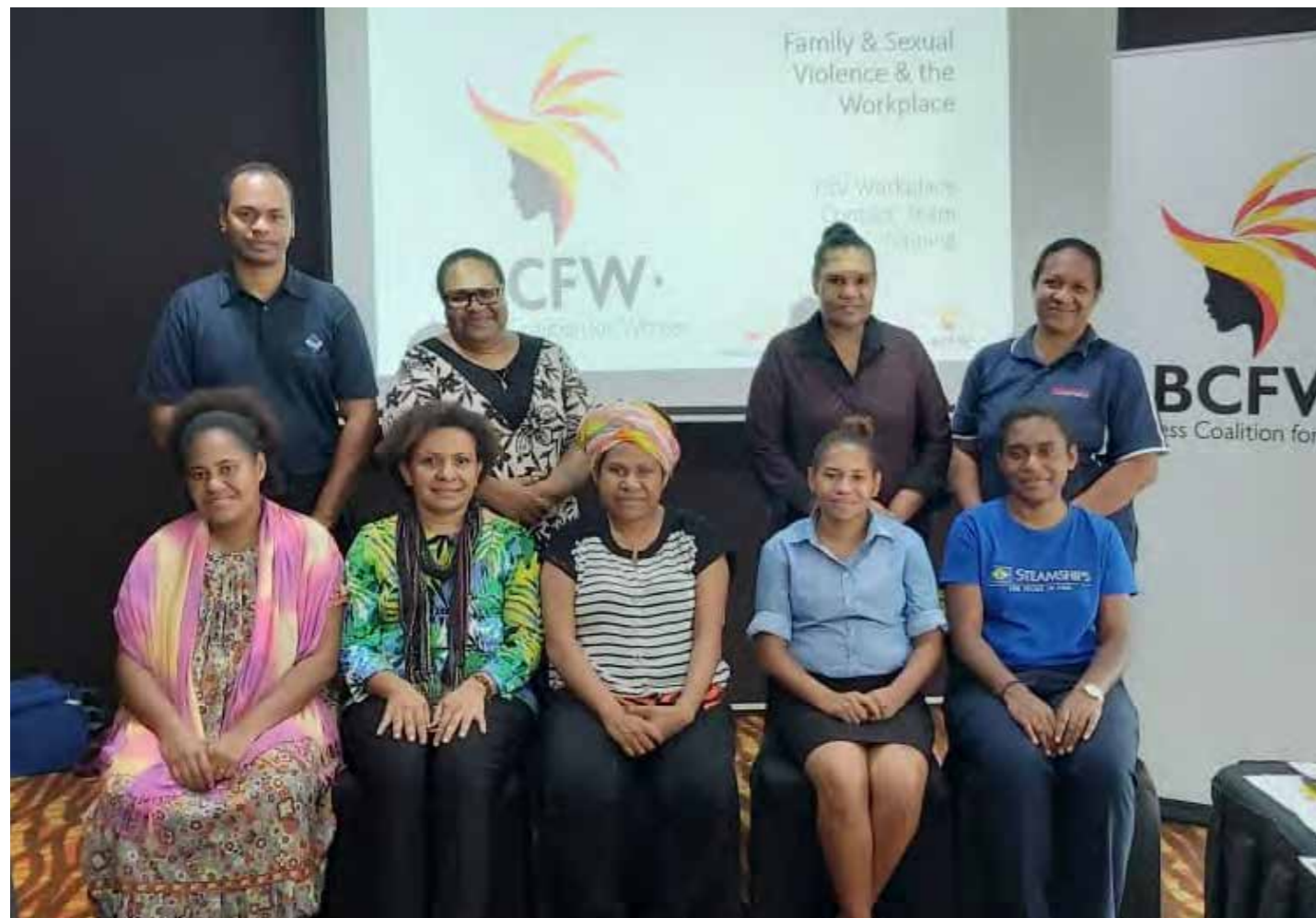
Steamships contacts during their workshop on FSV in the workplace.

Research indicates that 68% of employees experience family sexual violence (FSV) during their lifetime, which is an estimated K3million loss to a single company in PNG each year.