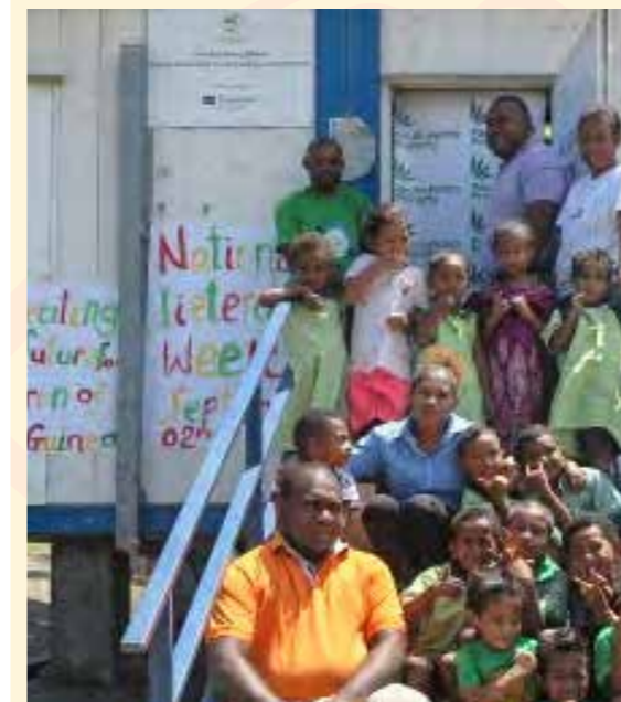
PPP Team visited Hagara BbP library during Literacy week for the Robot building session.

In support of this partnership, we had some of our divisions go out to the Steamships sponsored Buk Bilong Pikinini (BbP) Libraries to celebrate Literacy Week. Steamships has three (3) sponsored libraries that are located in Port Moresby, Goroka and Lae.