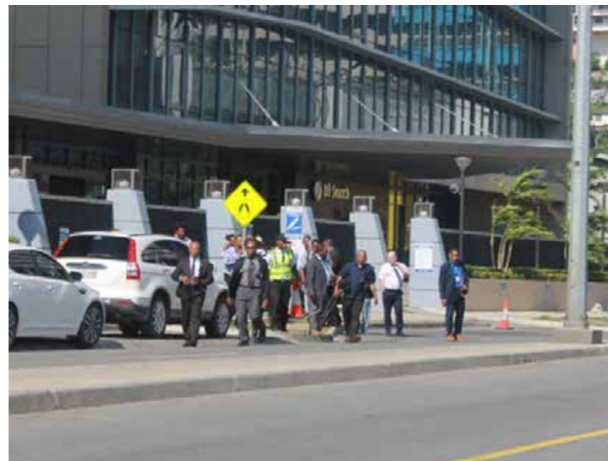
Dignitaries and members of the media contingent cross the road from Harbourside for the ceremony at the project site.