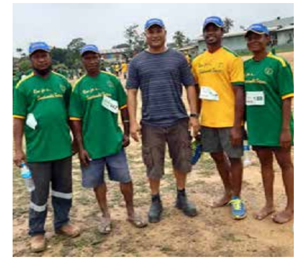
JVPS team picture after the a fundraising drive towards the Kiunga Hospital.