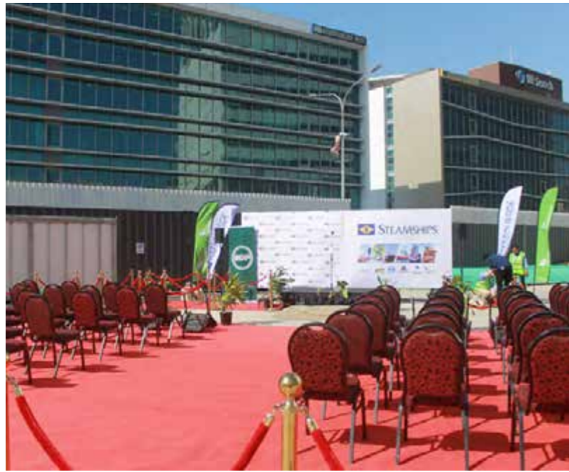
Ceremony set up ready for dignitaries for the ground breaking ceremony at the Harbourside South site