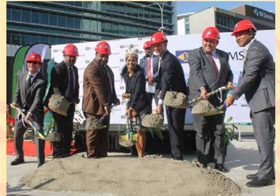
The official ground breaking of the Harbourside South Project