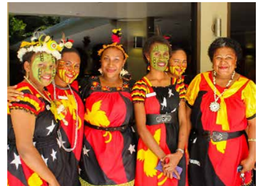
Gateway Hotel Staff in their PNG 'kolos'.