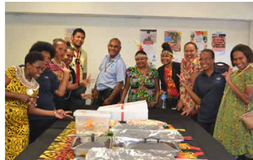
Coral Sea Hotels Corporate Office staff pose for photo before their Independence 'kaikai'.