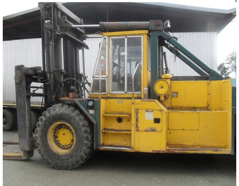
The forklift at the EWT yard in Hagen after being transported up from Lae

Security duties is not a new thing to them and most have been doing this job all their lives but one thing new that they are interested in is the tracking of containers that puts the whole operation in the system and they are proud to be employees of East West Transport.