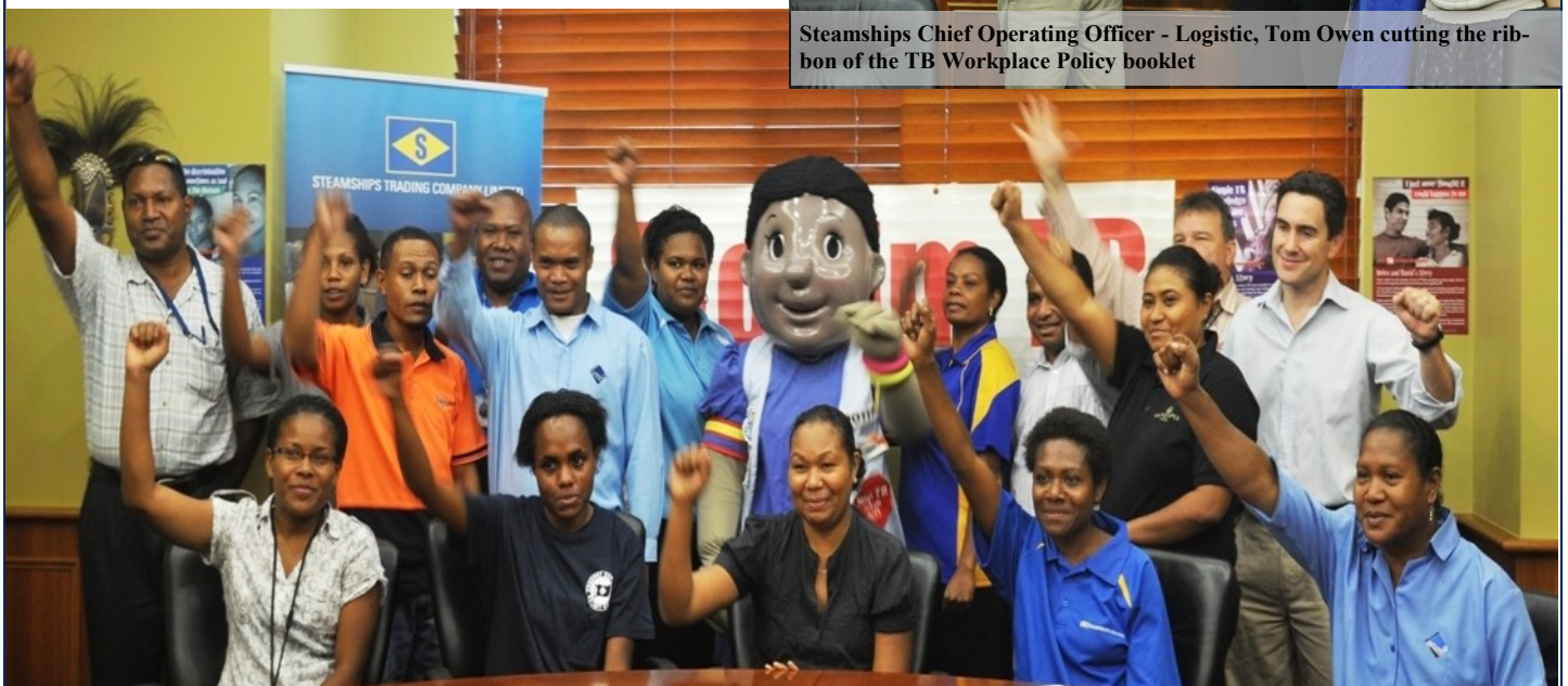
Representatives from STC's six business units who attended the two day TB 'Train the Trainer' workshop held at the Steamships Corporate office