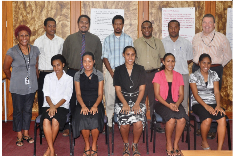
The ten taking part in the Graduate Management training program.

The graduate management program for framework is Steamships capacity building program for invigorating graduate accountants into an efficient and effective service delivery mechanism.