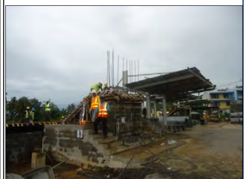
Work on the Blaikie Apartments in Lae